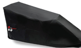
PSMMVDC* * PSM5000, 6000, 7000, 8000