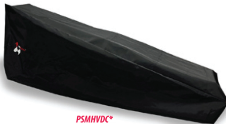
PSMHVDC* * PSM10K & 10KPRO