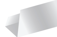
Eccentric C-Fold (EC)