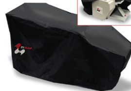
PSMLVDC* * PSM1800, 3000, 3000C